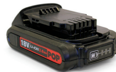
2.0Ah battery with charge indicator